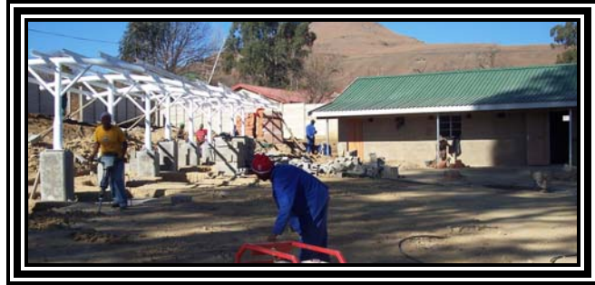
Vendor shelters and Administration Office